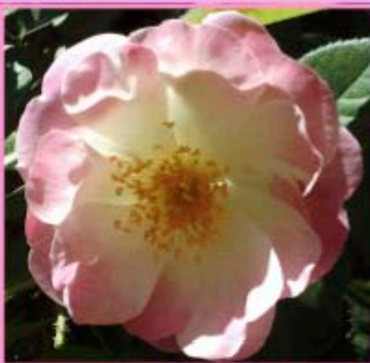
Hybrid Musk, 'Erfurt', smaller shrub than the others, delicate in color and moderate in size.

Hybrid Musks grow very well in Arizona in full sun, but will better retain their color in partial or late afternoon shade. In addition to 'Ballerina', I have grown stunning 'Buff Beauty' on an obelisk with great success, and a smaller shrub with a larger 3" flower, 'Erfurt', in a moderately shady area. Another unusual Hybrid Musk, which grows more upright, is 'Bishop Darlington.'