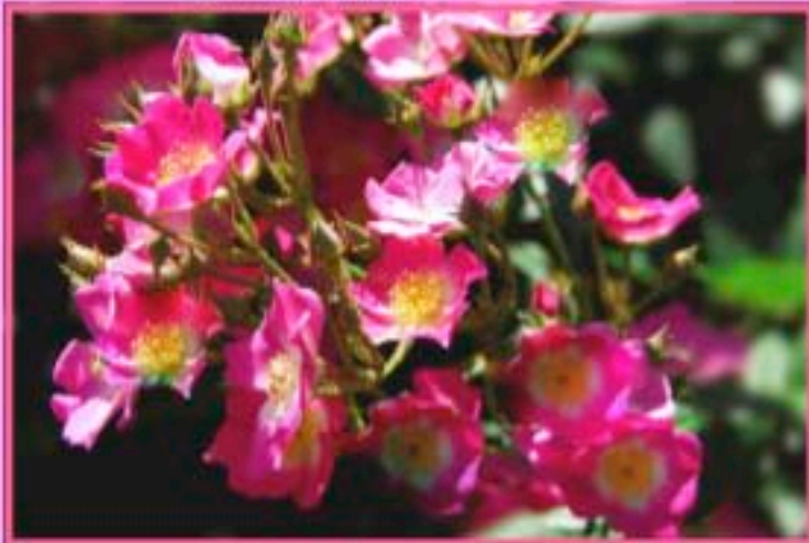
'Mozart' blooms with brilliant gold stamens in a white eye. Hybrid Musks all set hips well.