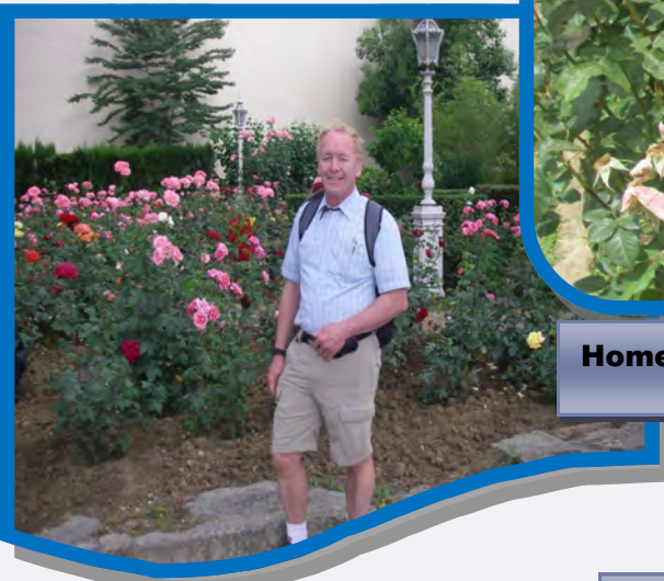
Entrance to Topkapi Palace, Istanbul, Turkey