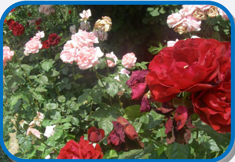
Home of St. John & Mary, above Ephesus, Turkey