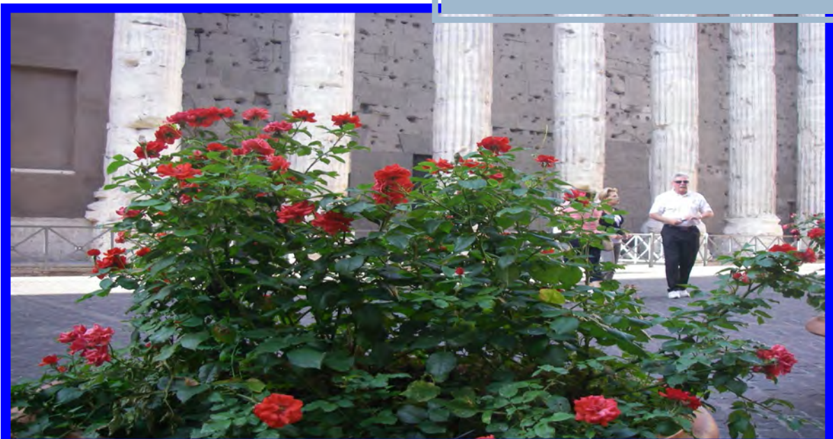
Rome - Parthenon