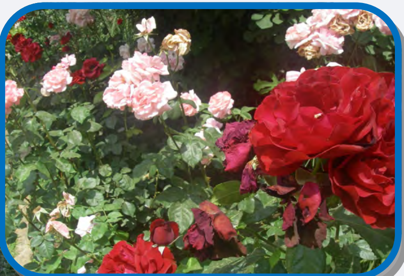
Home of St. John & Mary, above Ephesus, Turkey