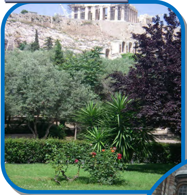
Athens Acropolis Greece