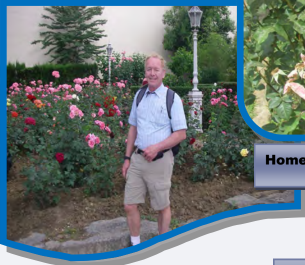
Entrance to Topkapi Palace, Istanbul, Turkey