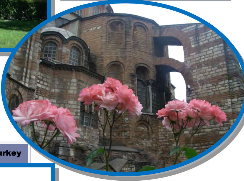
Basilica of Hagia, Istanbul Turkey