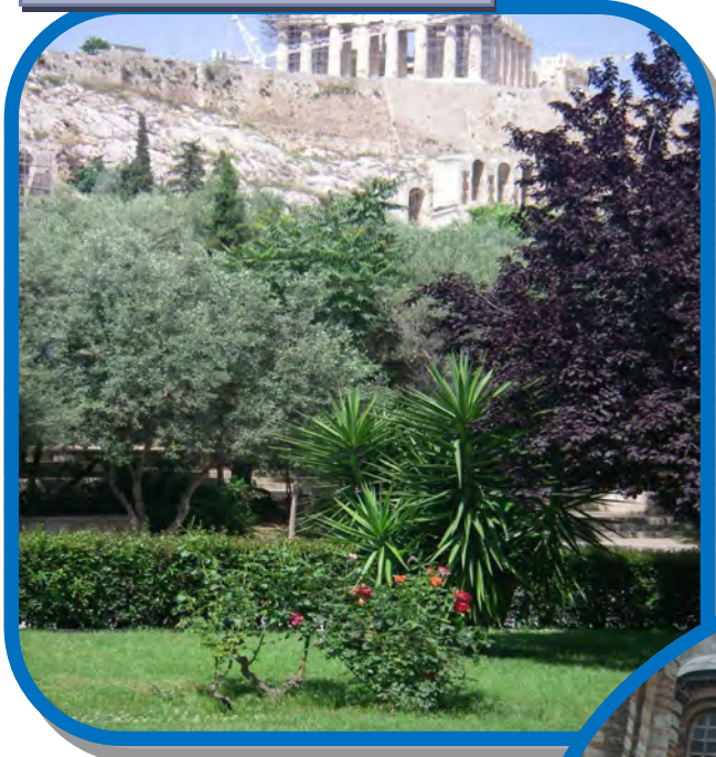
Athens Acropolis Greece