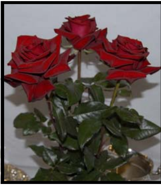
3 Black Magic HTs