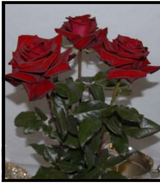
3 Black Magic HTs